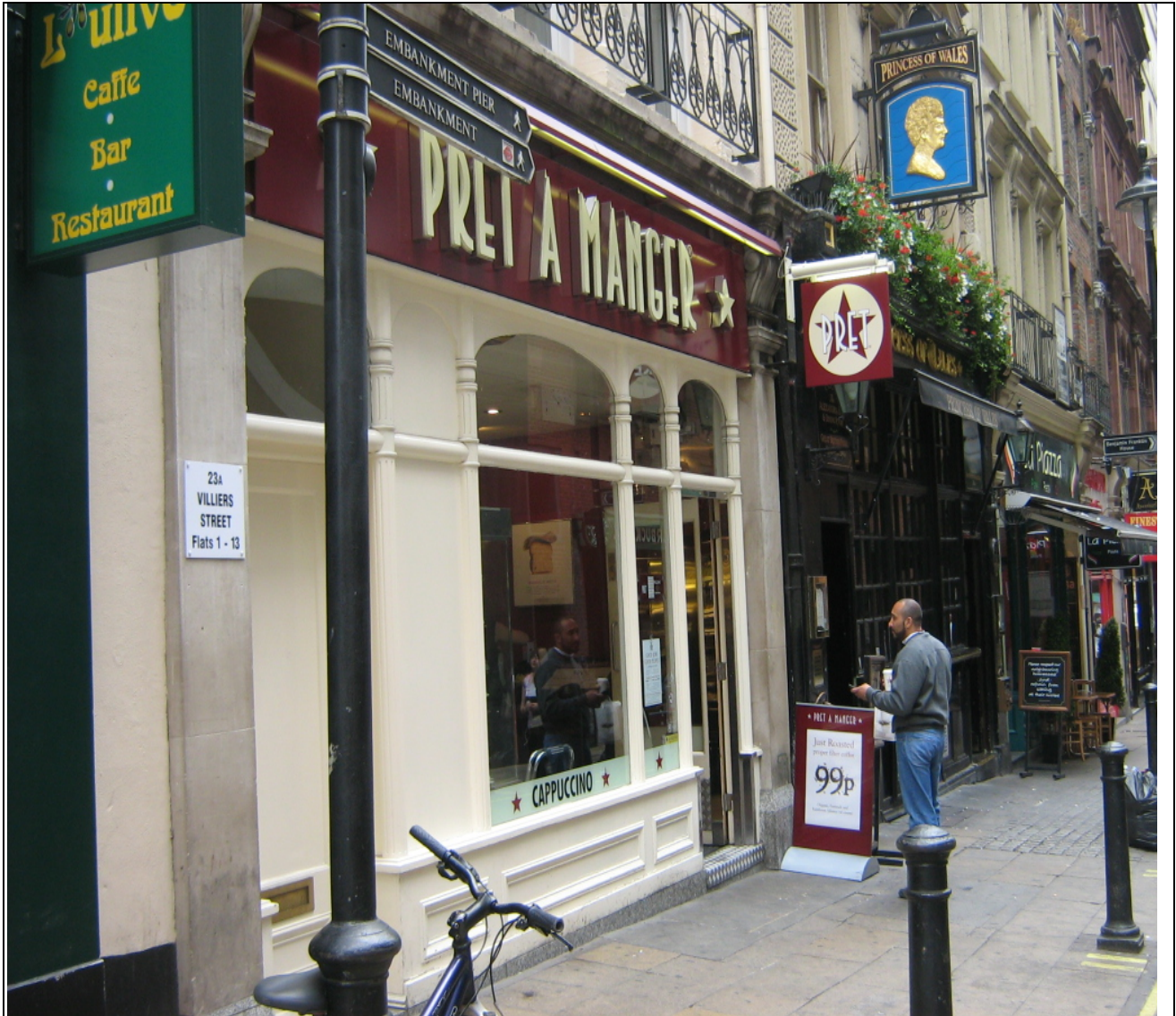
25 Villiers Street